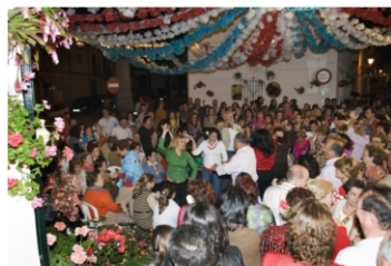
May Crosses atmosphere in the Plaza del Mantillo

bodega de López Ahumada - better known as "El Chocazo" - is found. Here you can try local wines produced using traditional ageing techniques called soleras y criaderas .