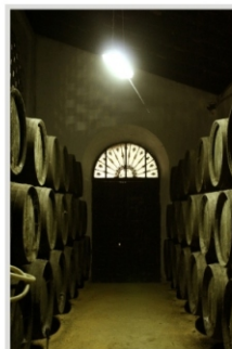
Sacristy cellar of the Andrés López Ahumada winery

We start in the plaza Manuel Halcón where was located, according to historical documents, the old puerta de Santiago. From here we follow the street José Sánchez de Alva, whose route mirrors the old cardo maximus that crossed the Roman city from the north to the south. Along its course we can admire examples of Lebrija's finest architecture, such as the Casa de los Ledesma or the 18 th century bodega (winery) of the Márquez de San Gil .